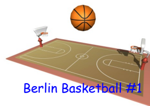
Berlin Basketball #1

March 26, 2007 - Fifth Six Week Grading Mid-Term.